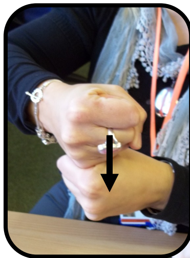
Granddad / Grandpa