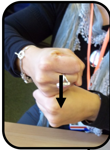
Nanny / Grandma