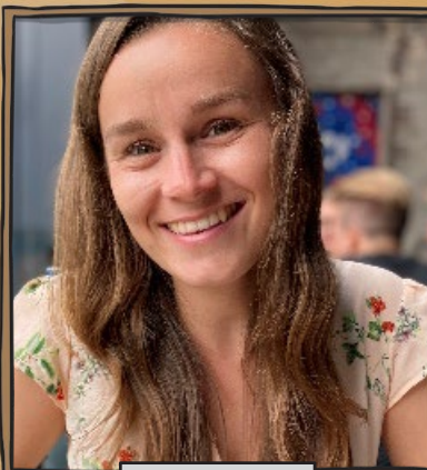
This is me